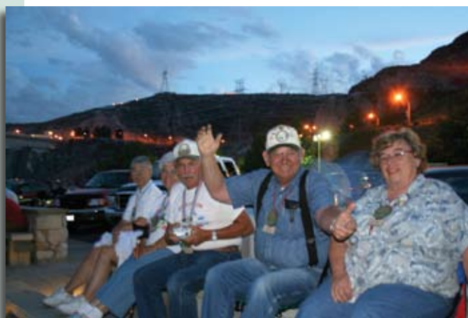
CBC'ers ready for the Laser Light Show at Grand Coulee Dam.